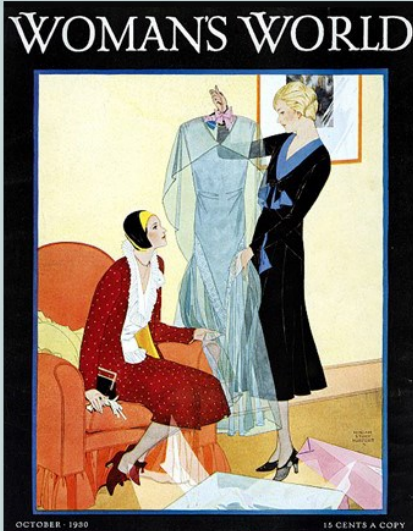
MARC Fashion Committee Seminar - Joliet, Illinois April 6, 2024

A Look Inside Fashion Judging: Model A Ford Era Fashions 1928 - 1931